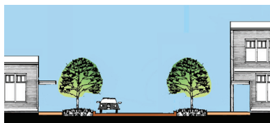
New street sections, which include amenities for pedestrians, are established in the plan.