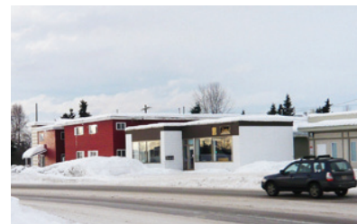
Commercial area in Anchorage