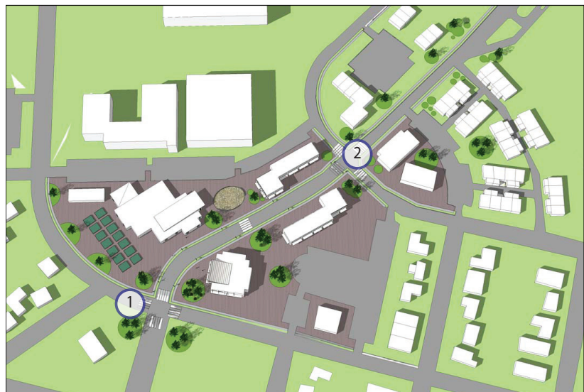
A series of alternative development scenarios illustrates opportunities for redevelopment that could occur in the center of the Government Hill neighborhood.