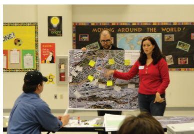
Residents participated in a series of community design workshops.