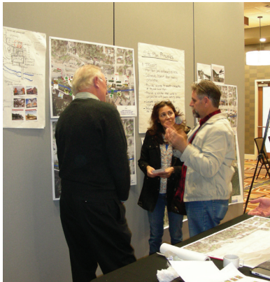
In a community open house workshop findings are presented and discussed.