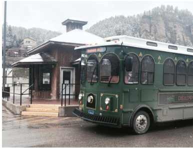
Existing trolley stop located on site.