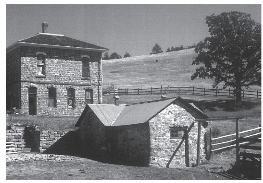
The main ranch house at the Frawley Ranch

By the 1990s, however, the property had fallen into disrepair to the extent that the Park Service commissioned a condition assessment to identify high priority needs for restoration and repair. Winter & Company conducted research on the property and then evaluated the condition of the key remaining buildings. Detailed work item recommendations were generated, along with cost estimates. The overall scope of restoration work was then prioritized in a series of phasing categories.