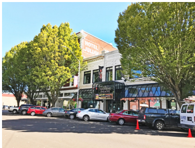
Spaces in historic commercial buildings are frequently large, accommodating a variety of uses while retaining the overall historic character.