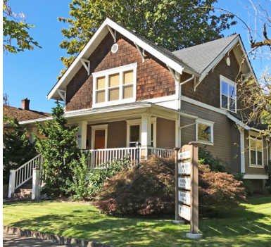
Historic structures reinforce the City's identity and contribute to its sense of community.