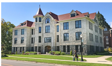
Historic buildings within Oregon State University's campus play a critical role in the preservation plan. These institutional buildings provide significant economic, sustainable, and heritage tourism benefits.