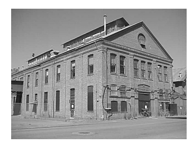
The design guidelines promote re-use of the island's historic industrial buildings.