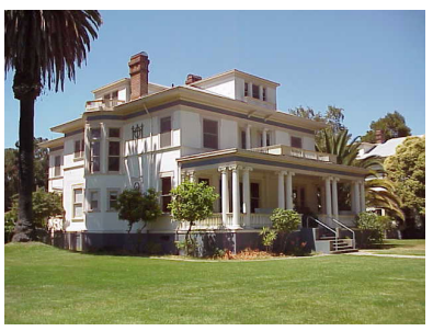
Mare Island includes a diverse range of character areas and building types reflecting over 150 years of military history.