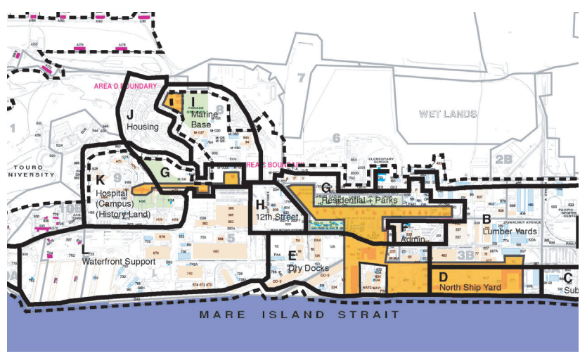
A framework map identifies key features and character areas on the island.