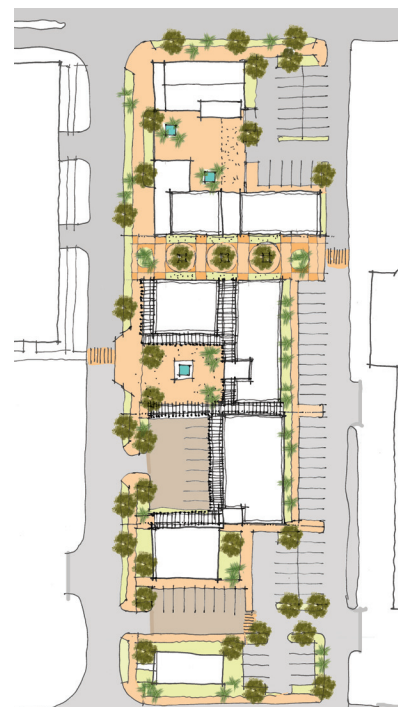
Case study concept sketch plan.