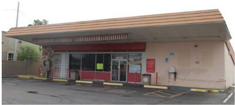
Before: Vacant Circle K on Corridor (A case study in Phoenix)

Winter & Company worked with the city to analyze the existing regulatory tools, and to identify additions or modifications to the zoning code that were needed to create a comprehensive Adaptive Building Reuse Program. Initial steps included a review of existing plans and regulations, how projects are reviewed and permits issued, potential educational tools, market conditions, and best practices used in peer communities across the country.