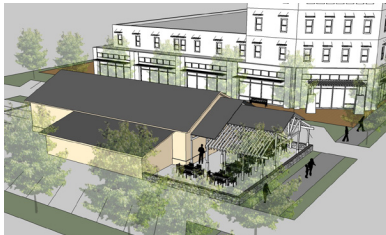
Case study model of a buildings before and after the tools and regulations have been implemented for adaptive reuse in Chandler.