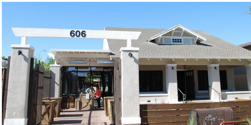
After: Vig Dining Establishment. (A case study in Phoenix)