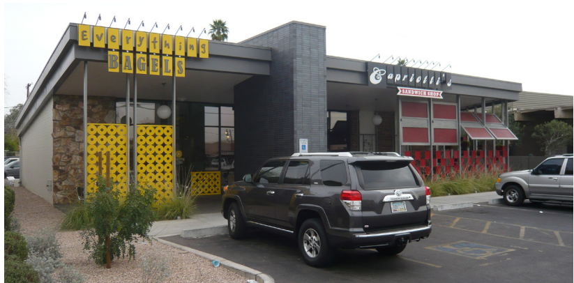
After: Capriotti's and Bagel Shop (A case study in Phoenix)