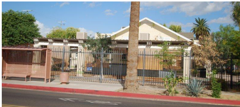
Before: Vacant residential structure. (A case study in Phoenix)