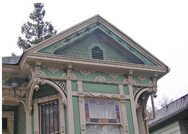
The guidelines include ways to protect and maintain significant stylistic features, such as these windows, gable spindlework and scroll brackets.