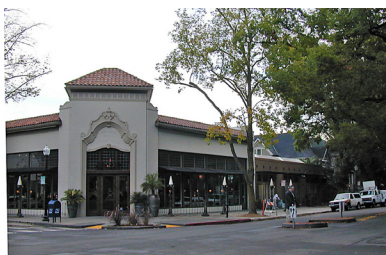
A commercial storefront in the Spanish Colonial Revival style that was popular in 1915.