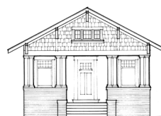
Preferred approach, when historical documentation is available.