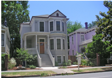
Typical raised cottage