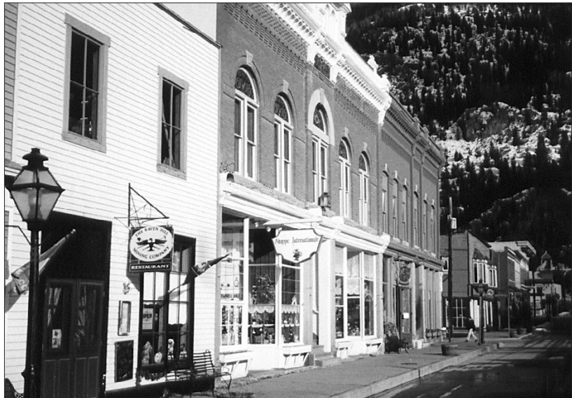
This block of two-story facades in the downtown preserves the traditional character of the streetscape.

The Preservation Plan summarizes the types of cultural resources that exist in the community and identifies the key issues related to their protection. The plan also outlines the roles of key players, including the preservation commission, local non-profits, and other branches of government. A discussion of the tools available for preservation and an implementation strategy are addressed in the plan.