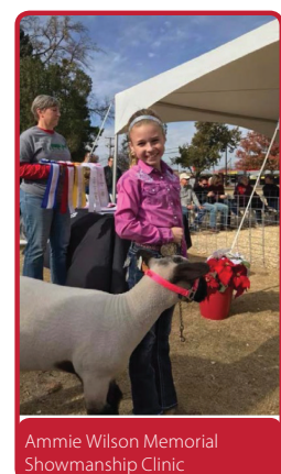
Ammie Wilson Memorial Showmanship Clinic

The Heritage Preservation Plan Update graphically illustrates many of the program's key components and includes links for the reader to learn more. For instance, the existing incentive and benefits are summarized in a series of charts with photographic evidence of projects previously completed with the help of grants and other funding mechanisms.