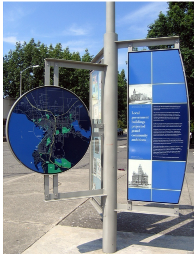
Plan results: New wayfinding system