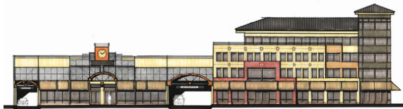
RAILROAD AVENUE ELEVATION

Before: Concept sketch for a new parking structure with mixed use "wrap"