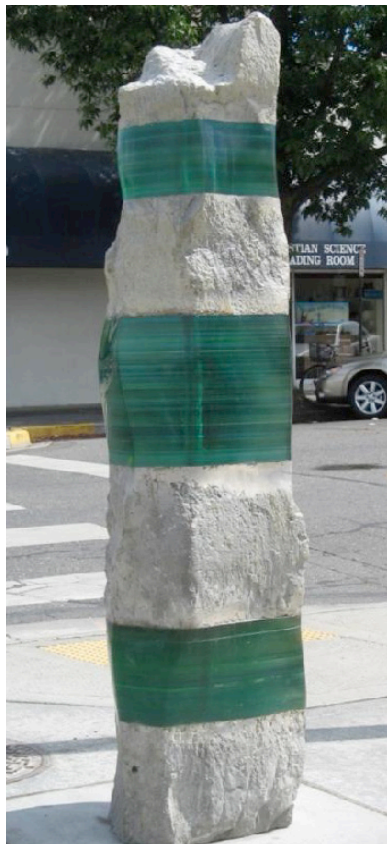
Plan results: New public art

The design guidelines illustrate appropriate principles for building rehabilitation, additions and new infill. They also address street furniture and site design. Inspired by the Plan downtown Bellingham is alive with new projects.