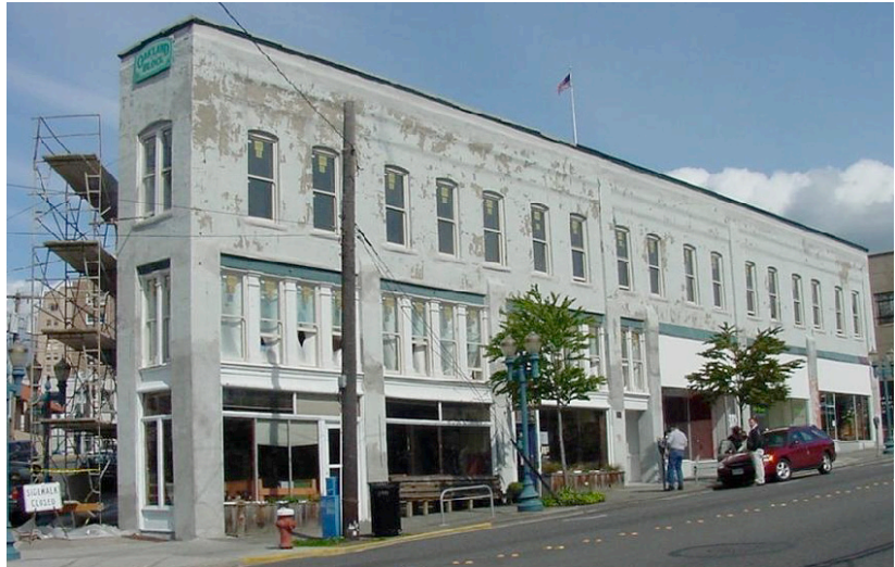
Before: Oakland Block Building

The design guidelines illustrate appropriate principles for building rehabilitation, additions and new infill. They also address street furniture and site design. Inspired by the Plan downtown Bellingham is alive with new projects.