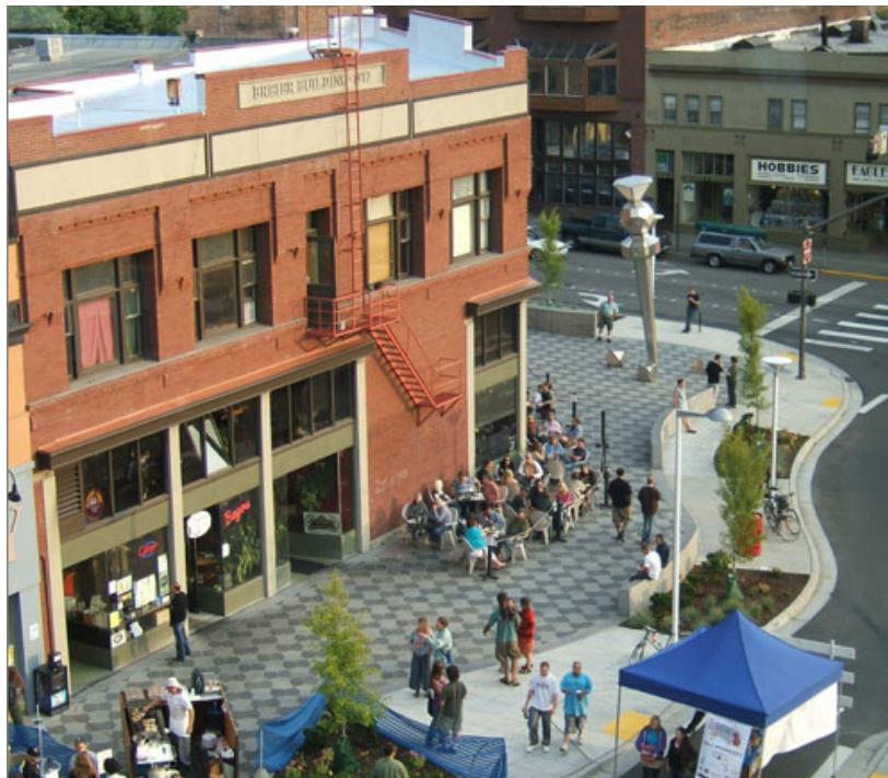
Plan results: Arts District at Bay Street