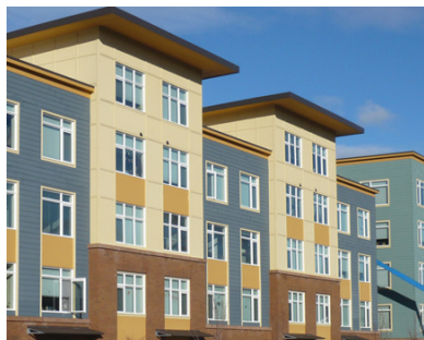
Plan results: Gateway residential infill