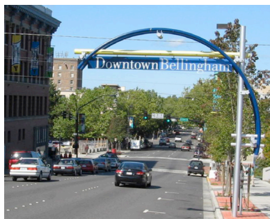
Plan results: new gateway structure