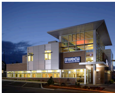
Plan results: new commercial building