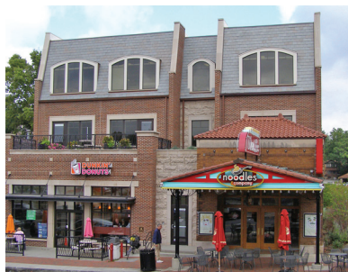
Plan Results: Vonlee Theatre building rehabilitation