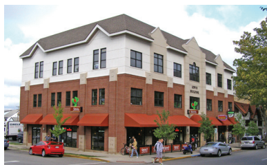
Plan Results: Lewis Building Mixed-Use infill