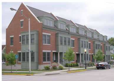
Plan Results: Washington Street townhouses