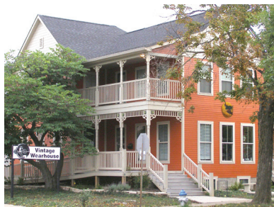
Plan Results: Vintage Wearhouse rehabilitation