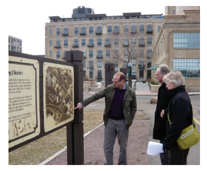
Several on-site tours were conducted in order to fully understand the historic characteristics of historic districts in Minnesota. This led to a thorough training manual.