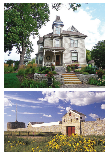
Historic properties, structures, sites and rural landmarks were all addressed in the training manual.