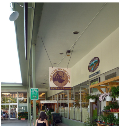
Historic downtown Brattleboro remains the center of the community.