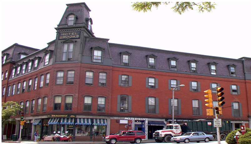
The ornate 1871 Brooks House is the largest commercial structure in downtown Brattleboro.