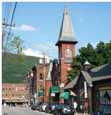
Downtown Brattleboro boasts one of the greatest collections of historic commercial buildings in New England.