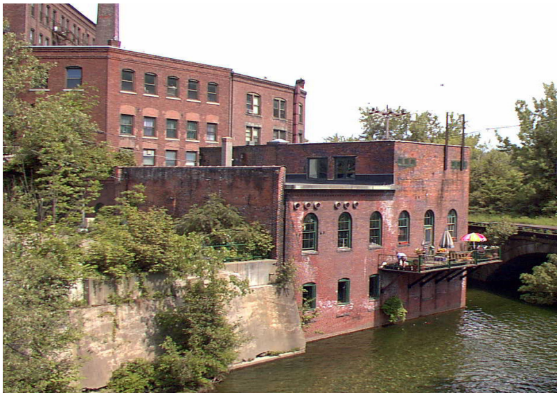
The design guidelines address the relationship of the rear of historic commercial and industrial buildings to Whetstone Brook and the Connecticut River.