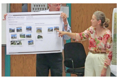
In a hands-on activity, residents chose pictures of alternative infill prototypes that would be compatible. This information helped form a vision for Old Town.