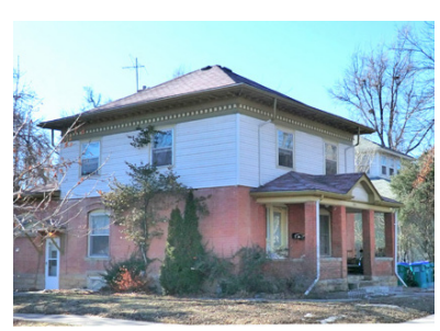
A strong historic context exists in much of the Eastside and Westside neighborhoods.