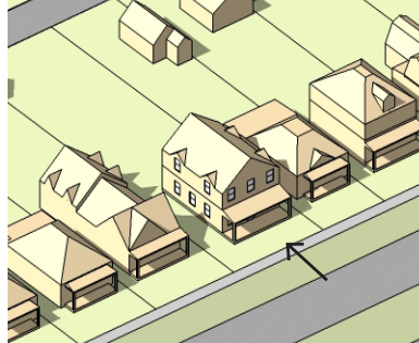
Digital models illustrate the effects on compatibility.