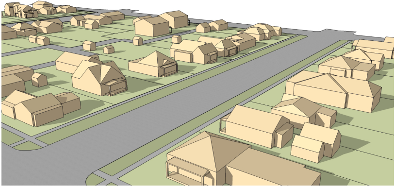
Models of several contexts were used to test compatibility across areas with distinguishable characteristics.

A neighborhood-wide questionnaire helped determine the issues occurring with infill in the Old Town area.