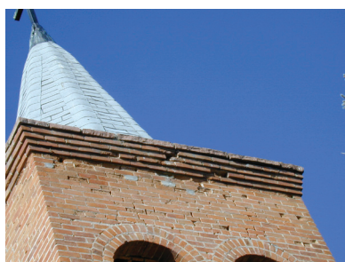
A photographic documentation of the facility was developed.