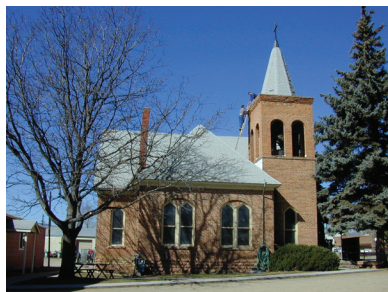
United Methodist Church