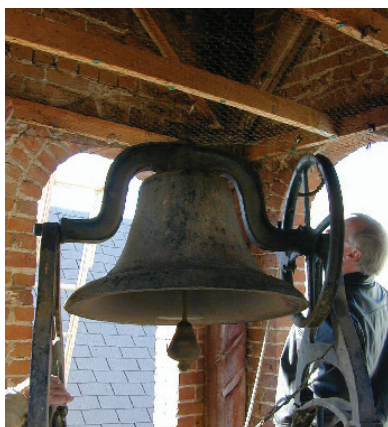
Noré Winter inspecting the bell tower.