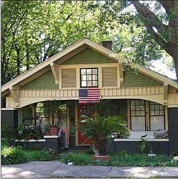
Design guidelines represent community policy and that the Commission's role is to administer them.