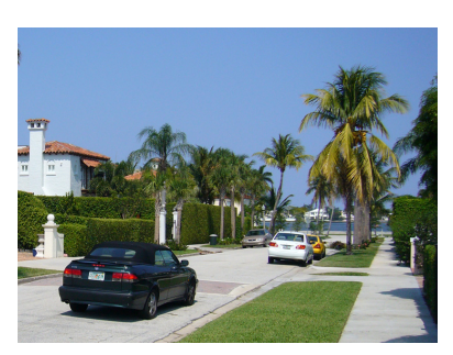
Access to the Intracoastal Waterway is contributing to rising property values and development pressure in many of the city's historic districts.