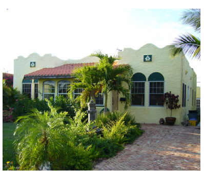
Because traditional mass and scale varies greatly across West Palm Beach's fourteen historic districts, standards and guidelines need to be context sensitive.