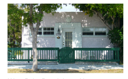
West Palm Beach is seeking to protect its unique architectural heritage.