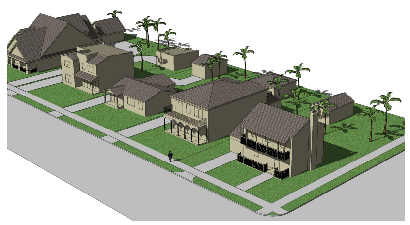
In the first phase of the project, Winter & Company modeled infill trends in different contexts throughout historic districts in West Palm Beach. The models help identify potential issues occurring with new development.