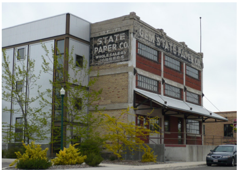
Renovated State Paper Company Warehouse

Winter & Company developed design guidelines for the Warehouse Historic District to ensure that the district's integrity is maintained, while also supporting its economic and cultural vitality. The guidelines assure that improvements in the district are respectful of, and responsive to, its historic significance. They address a range of improvement projects within the district including: rehabilitation of historic buildings, improvements to existing non-historic structures, construction of compatible new infill structures and site improvements. The guidelines assist in making determinations of appropriateness for proposed projects as well as providing education and advice to property owners in planning their projects.