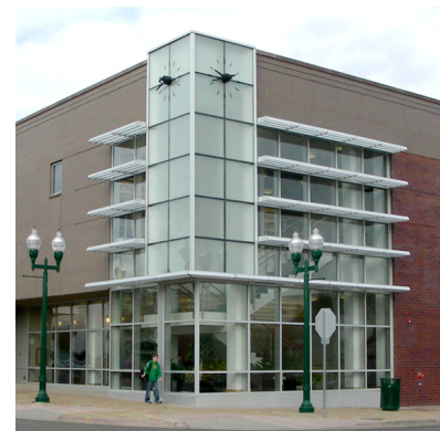
The new library

A framework plan identifies areas where rehabilitation of existing buildings is a focus and locates other parts along the Ralston Road corridor where infill is targeted. This map informed new design guidelines and code revisions for the area. This information will also be used by the City's Redevelopment Agency in its efforts to attract investment into the area.