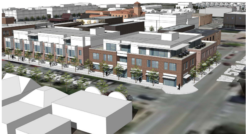
A computer model illustrates a combination of commercial and residential building types.

At issue is how to accommodate reinvestment that is compatible with the traditional scale and character of the area, while increasing density to support transit systems. The planning process included hands-on public workshops, focus groups and one-on-one interviews. Key public agencies were also actively involved, including the City's Planning Department, the Redevelopment Agency, the Downtown Business Association, and neighborhood organizations.