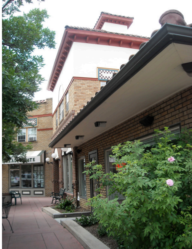
Buildings in Olde Town Arvada