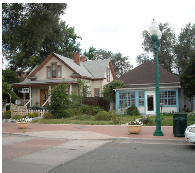
Residential edge in Olde Town