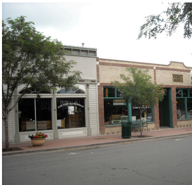
A low-scale portion of the historic district in Olde Town

Arvada is an inner ring suburb on the western edge of Denver, with a population of 100,000. The city is experiencing substantial growth, focused around new transit stations that are part of Denver's light rail system. The historic heart of the city, Olde Town, is revitalizing with rehabilitation and new construction projects.