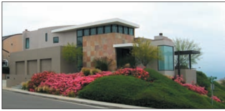
Residential design guidelines for Laguna Beach, CA encourage building that reflects the established relationships of siting and scale that is seen in the neighborhood.

Urban Design • Historic Preservation • Design Review