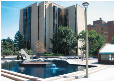
Clerc Hall at Gallaudet University in Washington, D.C. is a deaf student housing renovation project being undertaken by Winter & Company's Special Needs Studio.

Enhancing community livability, protecting cultural resources and providing delight in the community experience — these are the focus of design, preservation and planning services at Winter & Company — often in resort communities and other towns with special character.