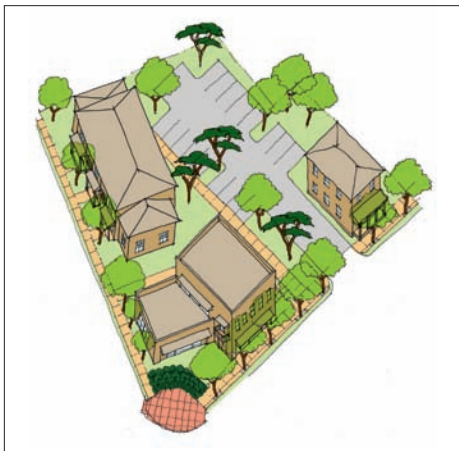
An opportunity site in a transition zone in Monterey, CA provides a mixed use cluster. Mature cypress trees were preserved, corners were anchored and pedestrian-friendly facades were incorporated.