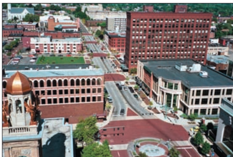
Streetscape improvements in the City of Canton, OH show how a Master Plan can come to life.