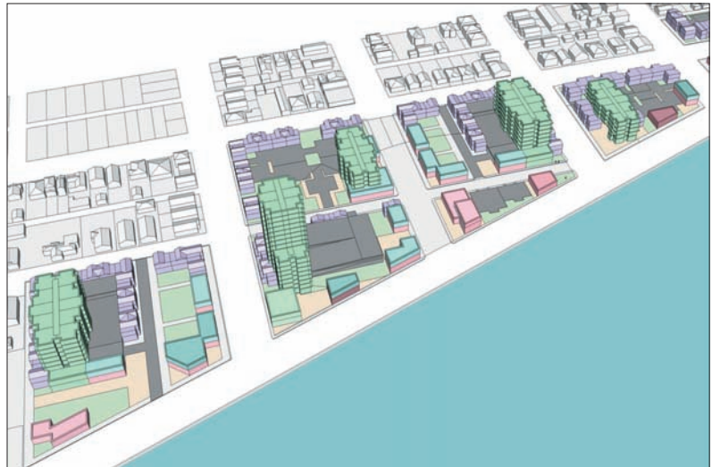
Form-based design standards and guidelines help ensure that taller, higher density development along the Galveston, TX seawall is compatible with adjacent neighborhoods and provides benefits to the overall community.

Winter & Company uses a process that actively engages stakeholders, residents and property owners in creative ways of team-building and problem solving. Community workshops, open houses, and stakeholder interviews are planned to be lively, informative and constructive.