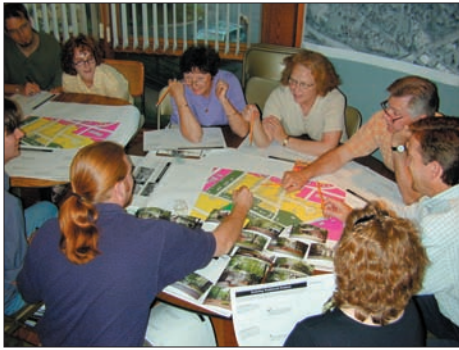
Neighbors in Greenville, SC define key features of their historic district.