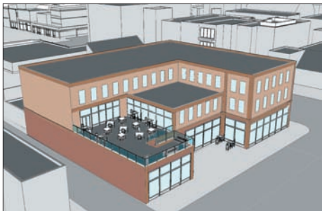
3-D development scenarios are used to analyze the affects of proposed standards and guidelines as well as illustrate the final review criteria.