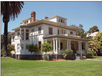
Mare Island includes a diverse range of character areas and building types reflecting over 150 years of military history.

The closure of the 150-year-old Mare Island Naval Shipyard at the northeastern edge of San Francisco Bay presented the City of Vallejo with challenges and opportunities. The historic naval facility was the largest industrial plant in California and Vallejo's primary employer. Although job losses were significant, the closure created a prime redevelopment opportunity as the navy transferred over 5,000 acres of shipyards, wetlands, open space and historic buildings to the City.