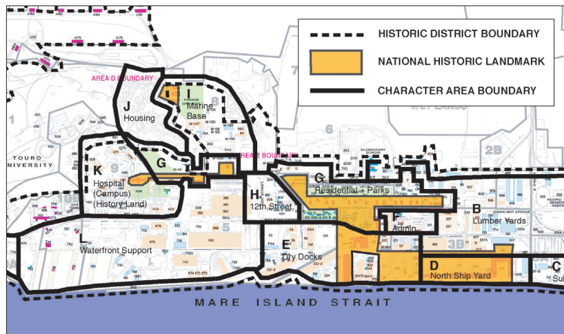
A framework map identifies key features and character areas on the island.