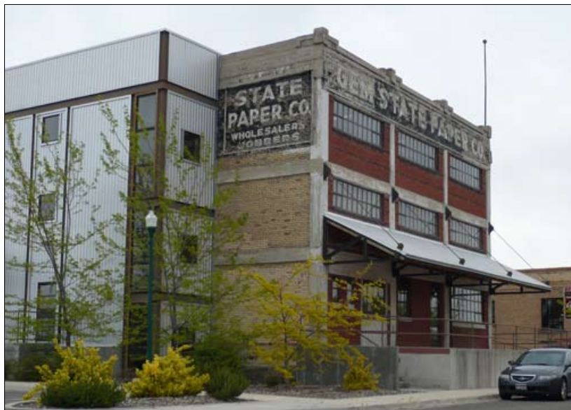
Renovated State Paper Company Warehouse

Winter & Company developed design guidelines for the Warehouse Historic District to ensure that the district's integrity is maintained, while also supporting its economic and cultural vitality. The guidelines assure that improvements in the district are respectful of, and responsive to, its historic significance. They address a range of improvement projects within the district including: rehabilitation of historic buildings, improvements to existing non-historic structures, construction of compatible new infill structures and site improvements. The guidelines assist in making determinations of appropriateness for proposed projects as well as providing education and advice to property owners in planning their projects.