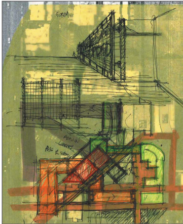
Preliminary concept sketches