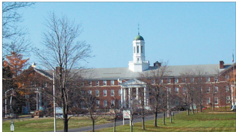
Exterior of Gallaudet Hall