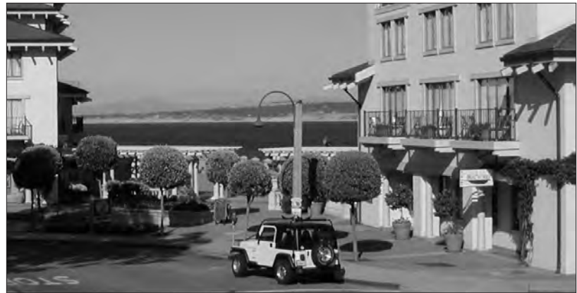
A new hotel along Cannery Row is divided into two wings to preserve an identified view corridor to the waterfront. An underground connection links both wings.