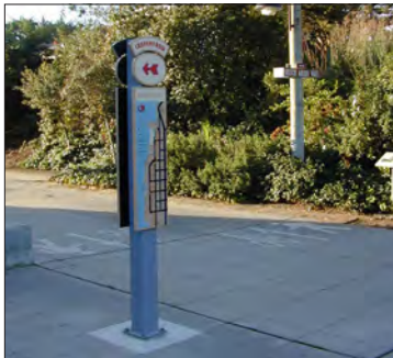
A coordinated wayfinding system helps visitors navigate Cannery Row and its integrated rails-to-trails path.