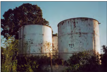
The conservation program encourages preservation of industrial artifacts associated with the canning industry that are present throughout the area.