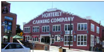
Warehouse type building