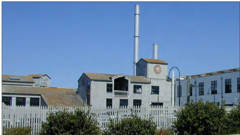
The Monterey Bay Aquarium helps attract millions of visitors a year to Cannery Row. It is built around an old cannery building, reflecting the area's informal industrial design traditions.

The conservation program for Cannery Row promotes rehabilitation of existing historic buildings and construction of new infill buildings that reinforce the historic context while avoiding imitation. New buildings draw upon traditional industrial building forms while interpreting them in creative ways that reflect the area's informal design traditions. Both new and rehabilitated buildings house specialty retail establishments, restaurants and hotels that create a vibrant environment for visitors.