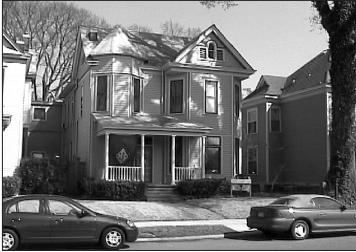
Design guidelines represent community policy and that the Commission's role is to administer them.