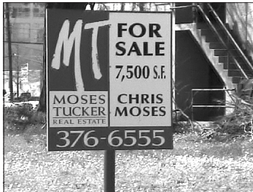
Across the nation, thousands of communities promote historic preservation because doing so contributes to neighborhood livability and quality of life and yields economic rewards.

Little Rock has operated a preservation program for many years and has a series of historic districts. Some districts are under local ordinance protection and others are National Register Historic Districts. In the year 2000, a controversy arose about the effectiveness of the program and its relationship to neighborhood revitalization objectives. In response, the city requested that the preservation program be evaluated to identify where refinements in policies, ordinances and guidelines might be needed.