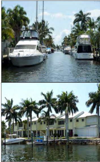
Because many of the city's neighborhoods are threaded with canals, a project goal is to address the development character as experienced from the water.

One of the goals identified through the Neighborhood Development Criteria Revisions project includes maintaining and enhancing the character of the street, ensuring that new multi-family development is compatible with single-family neighbors and promoting appropriate transitions along zone district boundaries. Potential tools to promote these goals include: