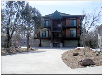
A new infill project caused concern among residents about its appropriateness in the neighborhood.