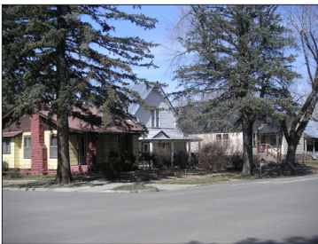
An established residential neighborhood.