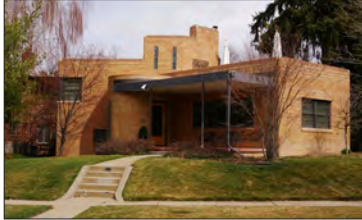
Denver includes a number of properties that may be considered as "recent past" historic resources.